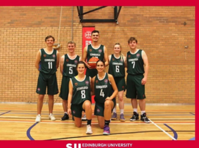
SU EDINBURGH UNIVERSIT